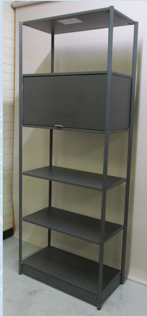
2 wide x 5 high