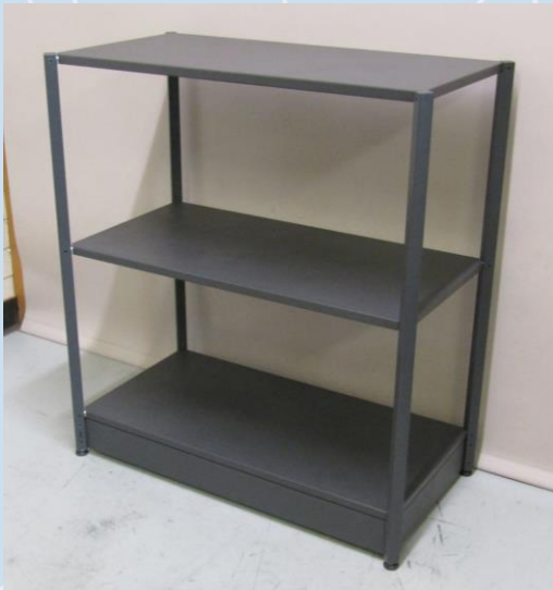
2 wide x 2 high