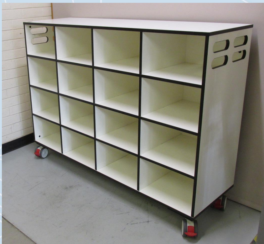
MSP A16 Type A Shown