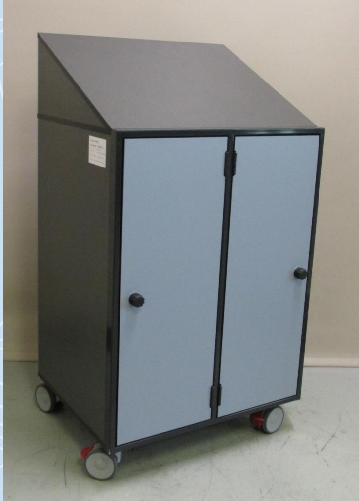
Pictured: PLS MB2 with locker hood