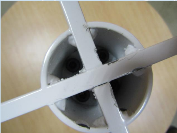
4 bolts securing star base to pedestal