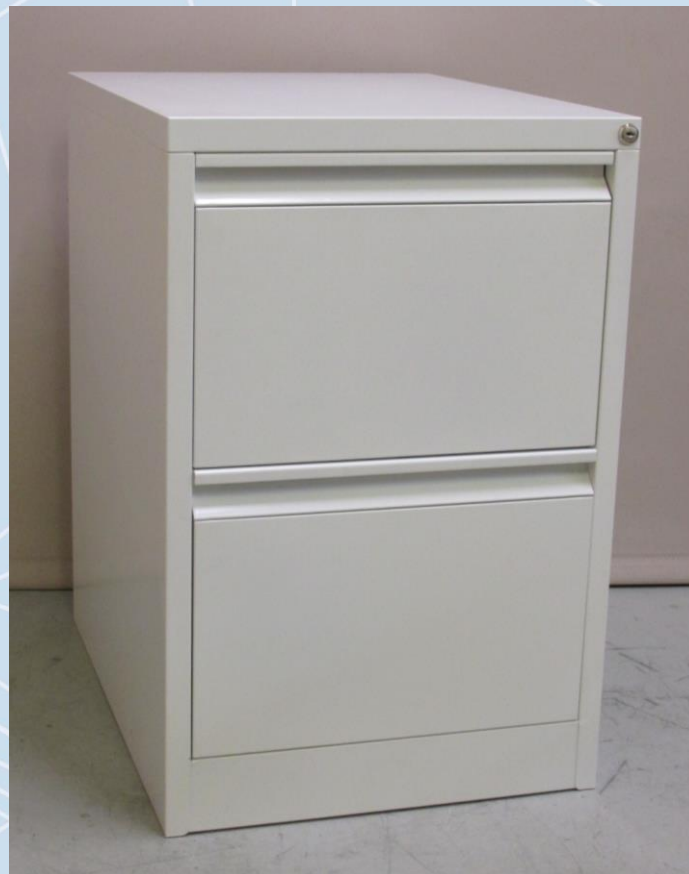
2 drawer cabinet pictured above.