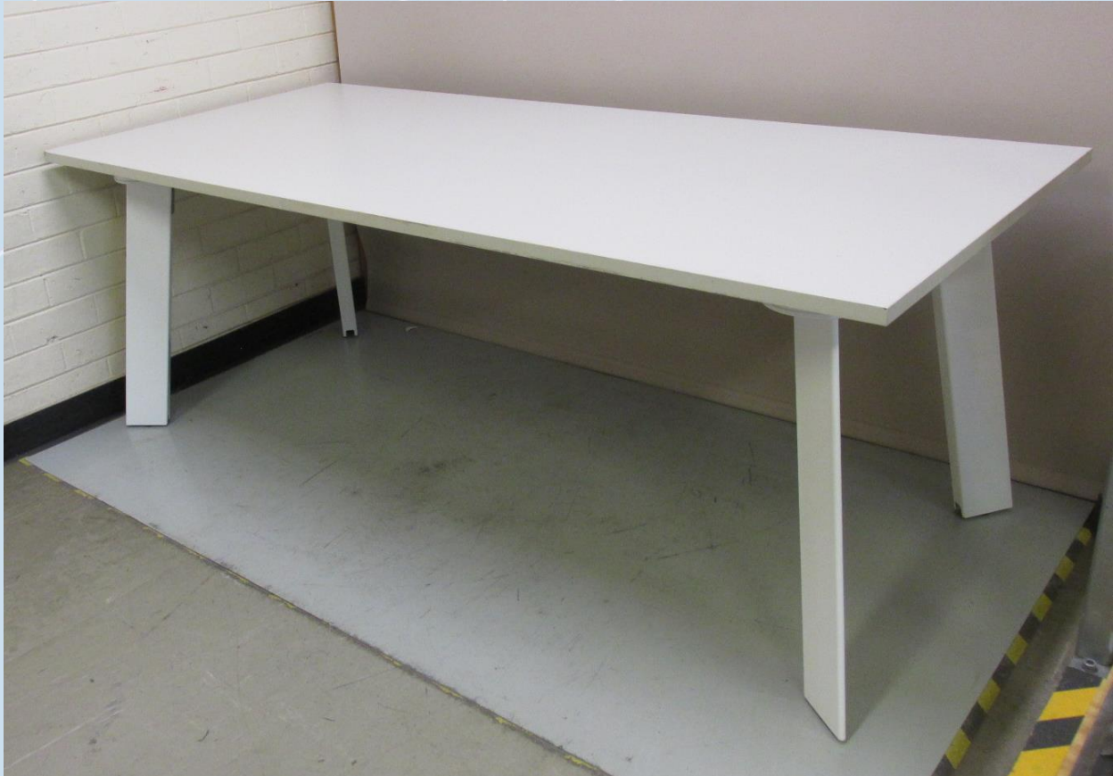
2000 x 900 mm shown